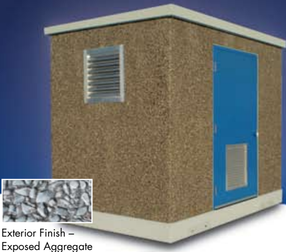
Exterior Finish – Exposed Aggregate

Did you know , there are over 16 key building standards which must be 100% in compliance to pass today's pesticide storage requirements? Whether you are building new or revamping an existing facility you should consider the durability and economics of a Hy-Grade Dura-Building.